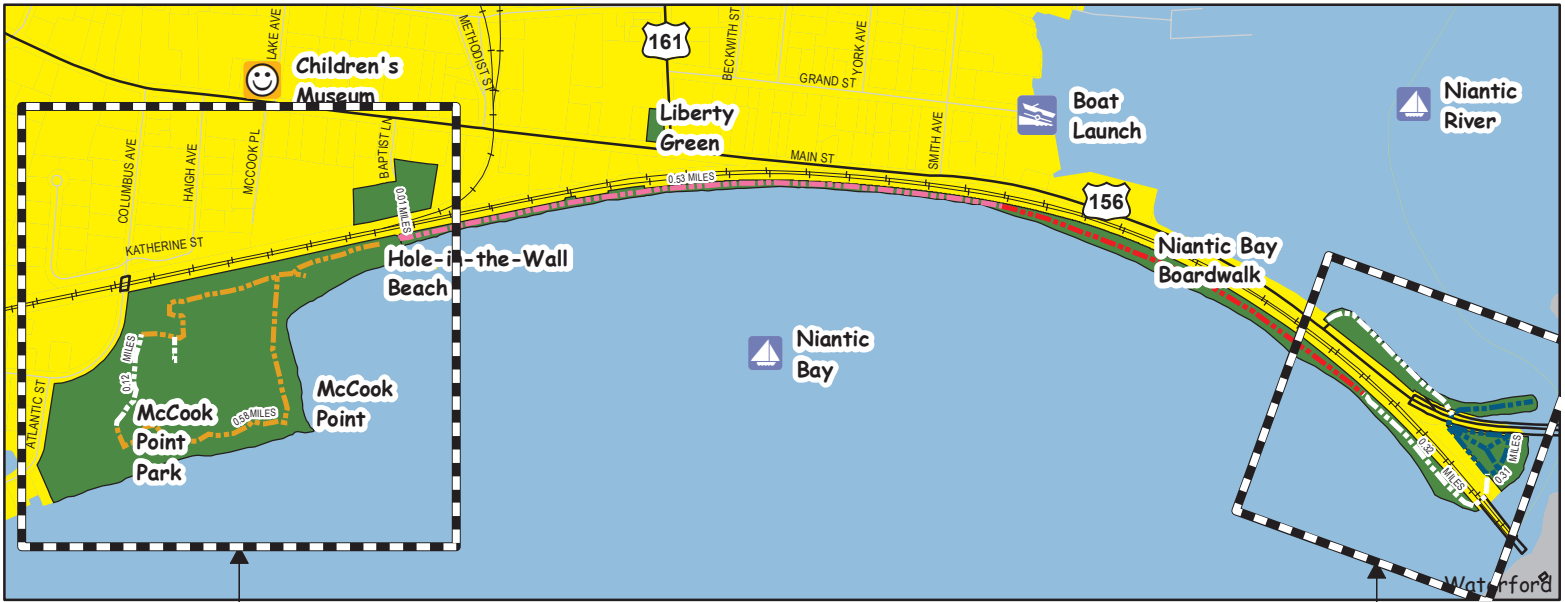
McCook Point Park Detail